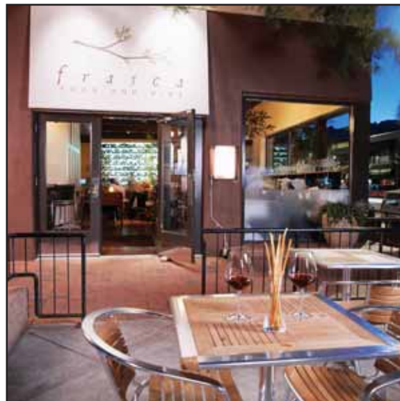
The award-winning Frasca Food and Wine graces JCO's neighborhood in Boulder.

In LoDo, look for the Denver Chophouse & Brewery , adjacent to Coors Field, or a small-plates favorite, Zengo . A little farther west, in the