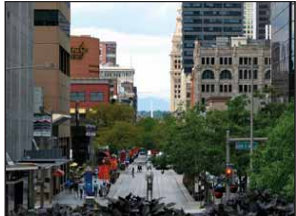
Denver's 16th Street Mall is a pedestrian zone connecting the financial district to LoDo.

The Colorado Convention Center itself has more than doubled in size since the 1997 AAO meeting. The adjacent Hyatt Regency Denver opened along with that expansion in 2005. But if you're wondering where the Democratic National Convention will take place in August, it's actually at the Pepsi Center, home of the Denver Nuggets