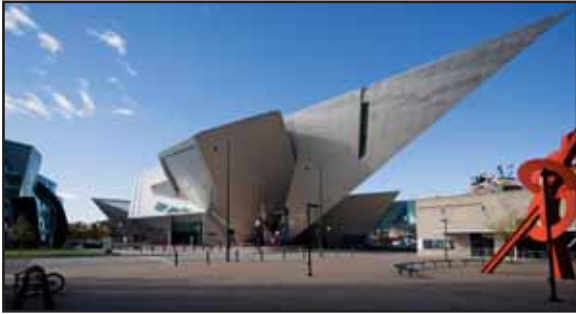
Frederic C. Hamilton Building, a recent addition to the Denver Art Museum.

Another new landmark building is David Adjaye's glassy Museum of Contemporary Art/Denver , which opened less than a year ago in Lower Downtown (LoDo). The inaugural exhibit, "Star Power: The Museum as Body Electric", features seven contemporary artists from countries around the world.