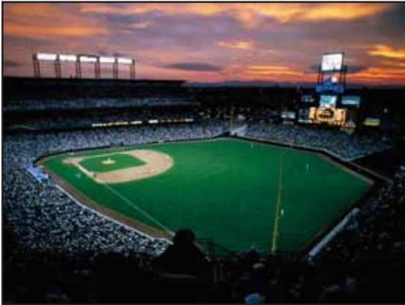
Coors Field, home of the National League champion Colorado Rockies.

The Great Western Art Gallery is downtown. Walker Fine Art Gallery and the Wilson Adams Gallery (both contemporary) are close to the Denver Art Museum. The other major gallery area, the ArtDistrict on Santa Fe, is nearby; exhibit spaces there include Kashi Kari Gallery (mosaics), Nine10Arts (“green” community), Sandra Phillips Gallery (contemporary), Sandy Carson Gallery (contemporary), Spark Gallery (cooperative), and Translations Gallery (contemporary).